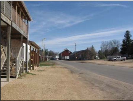
Quiet street in Westby, WI where pastor pat is staying for a month.

running errands, that way they don't have to leave their horse and buggy along the street. Now, you don't see THAT in West Lafayette